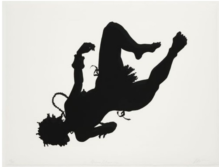
Kara Walker African American (1998) Linoleum cut, edition of 40

artist's fantastical sculptures via intaglio with pigmented inkjet, collage, and additions by hand.