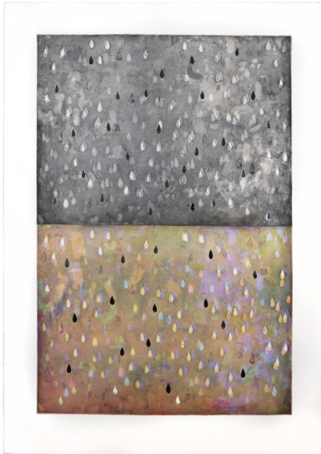
Kiki Smith Esperanza (2015).