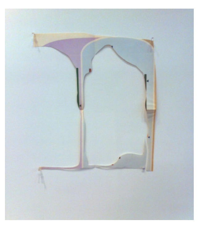
Austin Thomas, "Data Removal" (2014), cut paper, 19 x 17 in

impenitent Duchampian assertion of yes, an untouched sheet of acid-tinged yellow legal paper is art if it is presented as art.