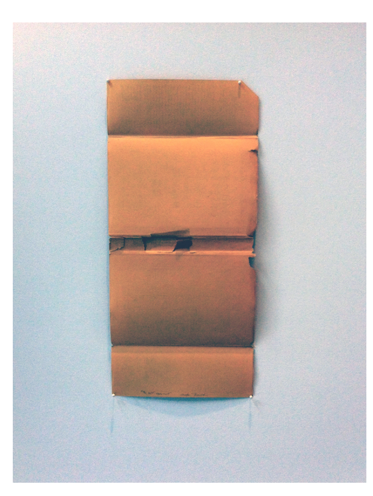
Austin Thomas, "The Self Observed" (2013), book jacket cover, 19 1/2 x 9 in

What opened up the exhibition for me was the three-dimensional quality of the blank, vertically oriented book cover titled "The Self Observed" (2013). It conveyed the kind of sculptural objecthood that I found so compelling in a number of Thomas's collages from three years ago, with their folds of colored or drawn-over paper projecting off the page.