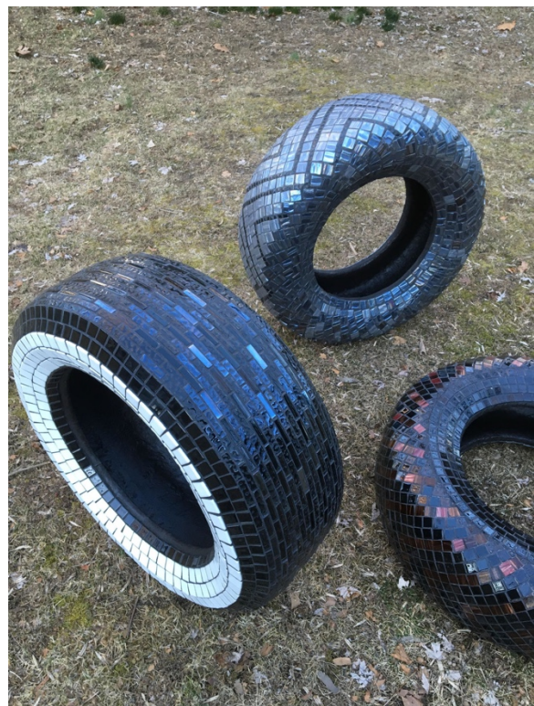
Work by Jason Middlebrook.