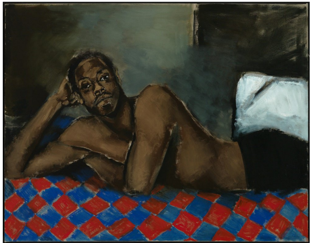
Lynette Yiadom-Boakye, Tie The Temptress To The Trojan (2016). Courtesy of the artist, Jack Shainman Gallery, New York, and Corvi-Mora, London, ©Lynette Yiadom-Boakye.