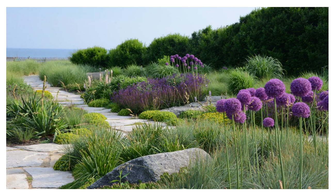
Slifka Beach House Garden, Sagaponack, New York.