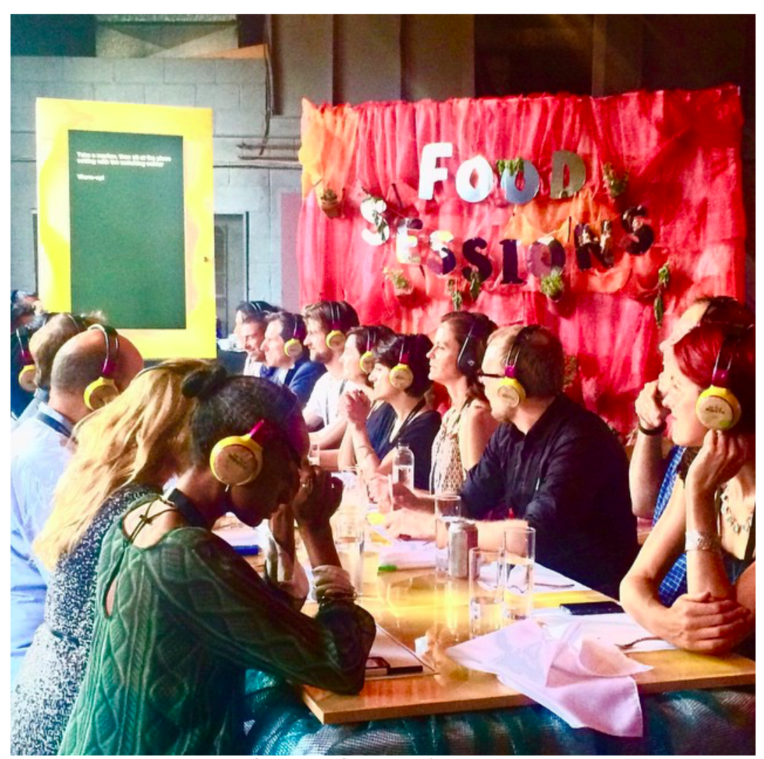
Daily Tous Les Jours Food Sessions.

Start off August right with these art events.