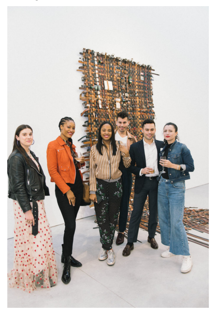
Guests at the event.