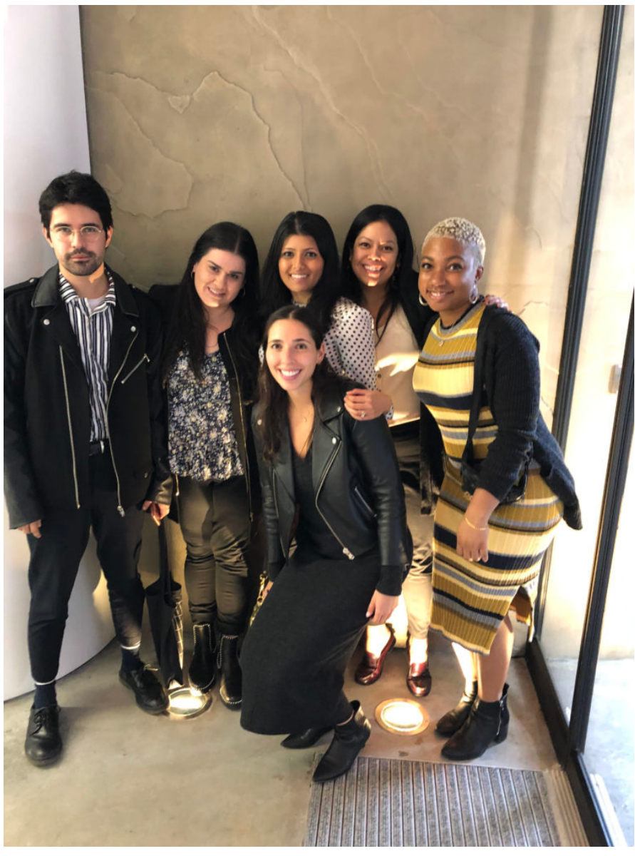
Members of the artnet Galleries team at the reception.