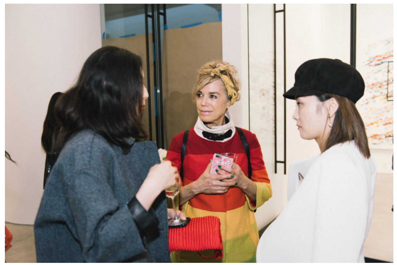
Guests at the event.