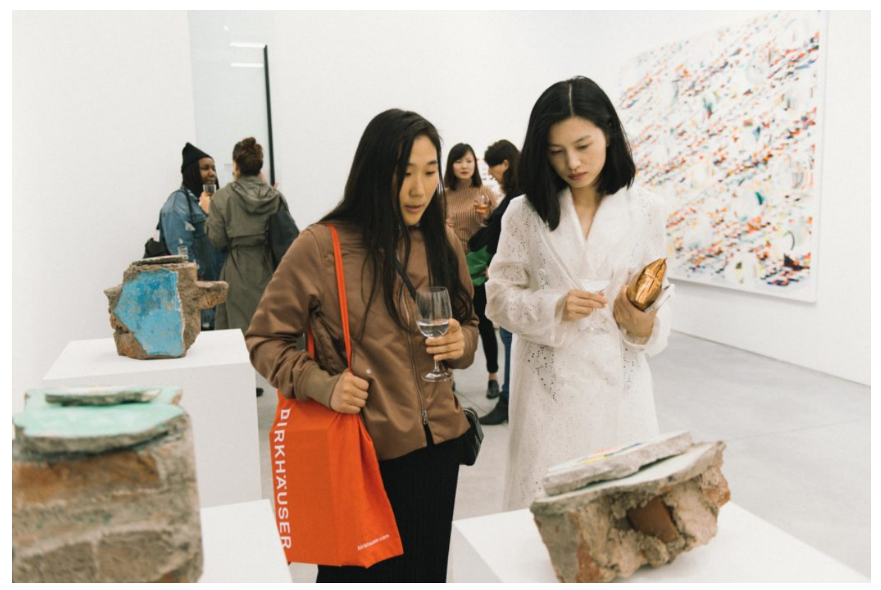
Guests viewed Nature Morte's pop-up exhibition at The High Line Nine, 2019.