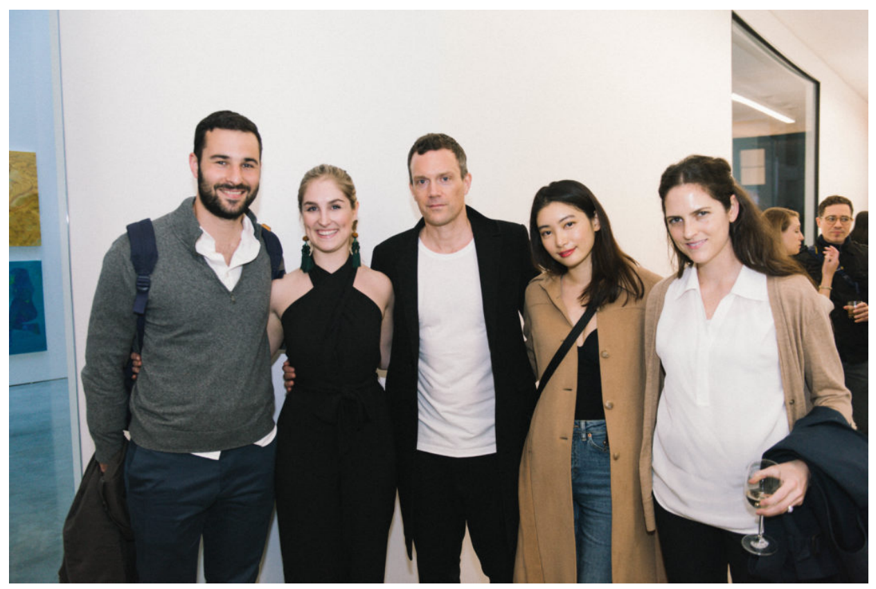
Guests at the event.